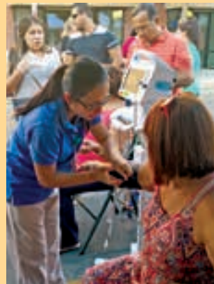
Adventist Health volunteers checked blood pressure for Thursday Night Market Place attendees.