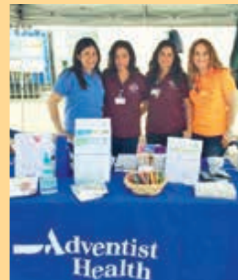
At the Selma block party, Adventist Health team members provided health information and screenings.