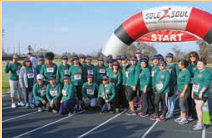
Forty-eight CREATION Health participants from the community and Adventist Health took part in the Reedley College Parkway 5K.